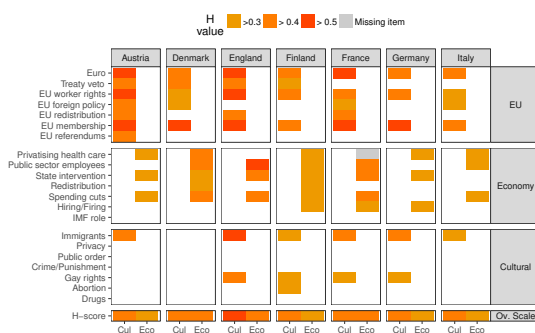
(a) Two-dimensional solutions (group 1)